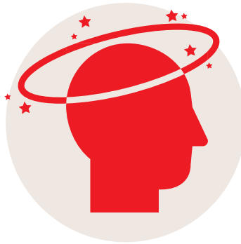
EXTREME DROWSINESS OR UNRESPONSIVENESS