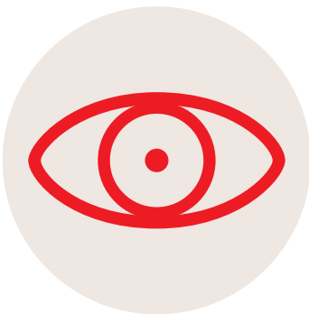
SMALL OR PINPOINT PUPILS