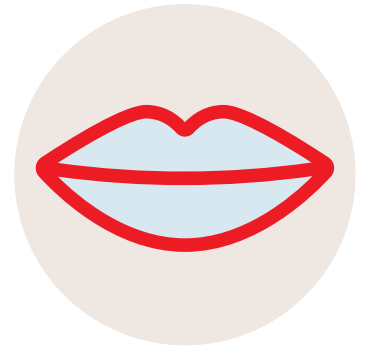
PALE OR BLUE/GREY SKIN OR LIPS