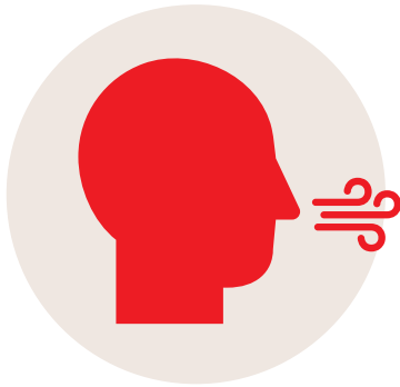
ABNORMAL, SLOW, OR NO BREATHING

Learn to recognize signs and symptoms that may indicate an opioid poisoning. Not all of these symptoms may be present.